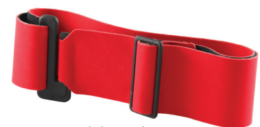
custo belt extender