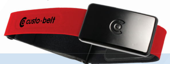
custo belt 1 electrode belt with custo guard 1 ECG transmitter