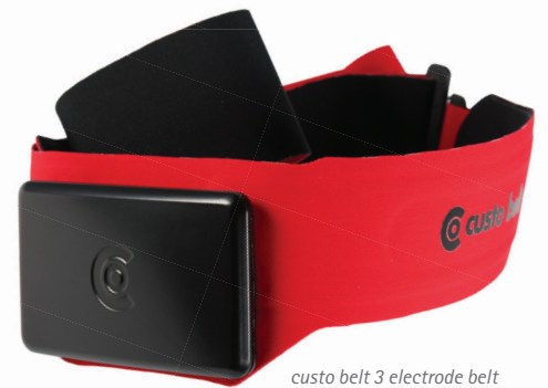
custo belt 3 electrode belt with custo guard 3 ECG transmitter